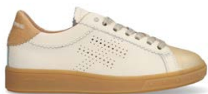
A039M574 Nata Camello