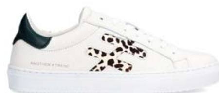
A0070082 Pony Animal