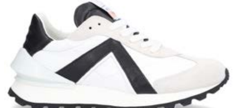
A001M170 Black & White