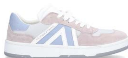
A009M281 Light Grey