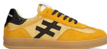
A03277C7 Mostaza Negro