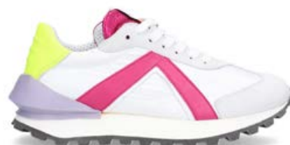
A0019972 White Fuchsia