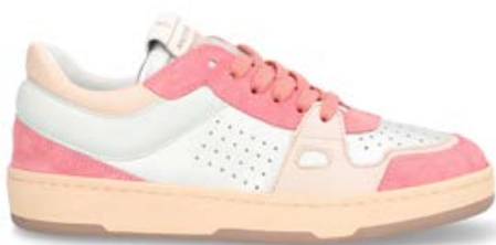
A030M282 White Coral