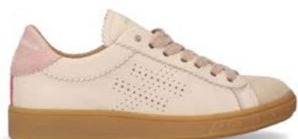
A039M573 Cream Rose