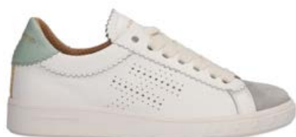
A039M575 Blanco Aqua