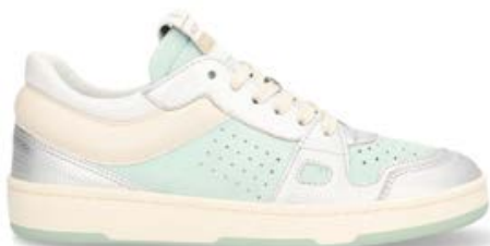
A030M283 Silver Mint