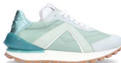
A0019983 Light Green