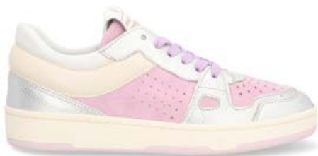
A030M279 Silver Lila