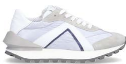
A0019981 Light Grey