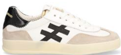
A0323100 Blanco Negro