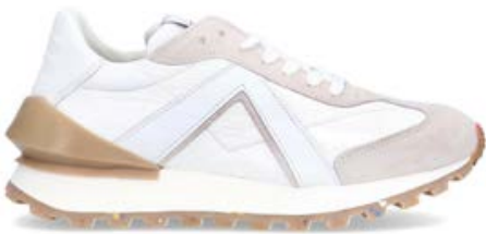
A001M100 Off White