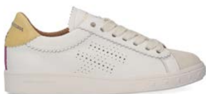
A039M571 Blanco Mostaza