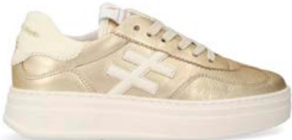
A0352643 Blanco Platino