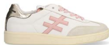
A0387177 Blanco Platino