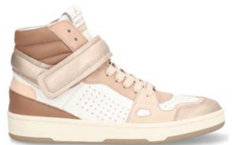
A028M280 Silver Taupe