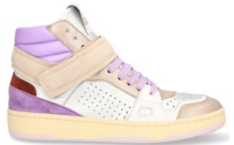
A028M279 Silver Lila