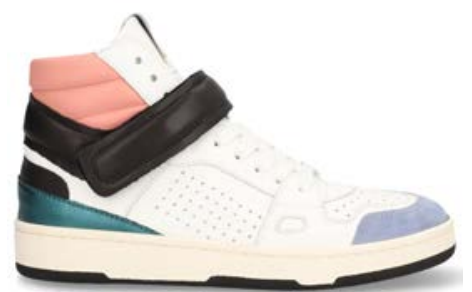
A028M281 White Jeans

Upper material 100% leather. Lining 100% vegan leather. Sole Rubber. Sole thickness 3cm. Removable breathable microfibre insole. 100% cotton laces. Heat-sealed logo on hook-and-loop closure.