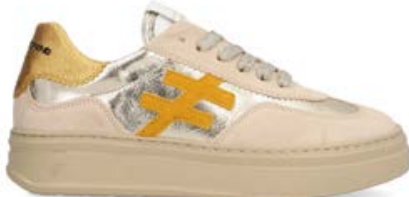
A0357879 Lino Platino