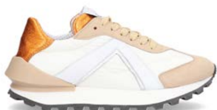
A0019973 Crudo Arena