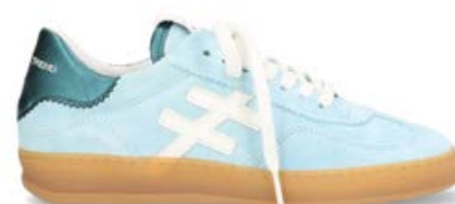
A032M367 Light Blue