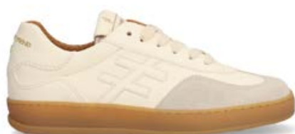
A0326453 Off White