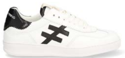
A032M371 Pure White