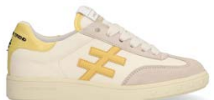
A0380453 Off White