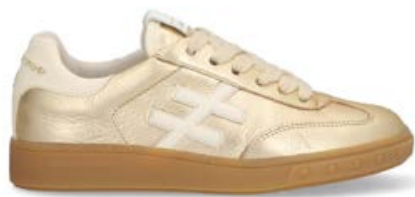
A0382643 Platino Blanco