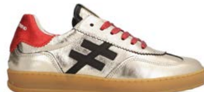
A0325878 Platino Rojo