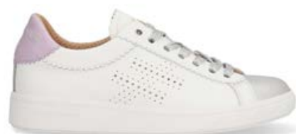
A039M572 Blanco Malva